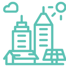
District heating network

Besides KSSENA consortium consists of three Slovenian partners Kolektor SetUp , Komunalno podjetje Velenje , and University of Ljubljana (Faculty of Mechanical Engineering, Faculty of Electrical Engineering) , and 4 associated partners Municipality of Celje , Municipality of Slovenj Gradec , Municipality of Velenje , Municipality of Šoštanj and Elektro Celje .